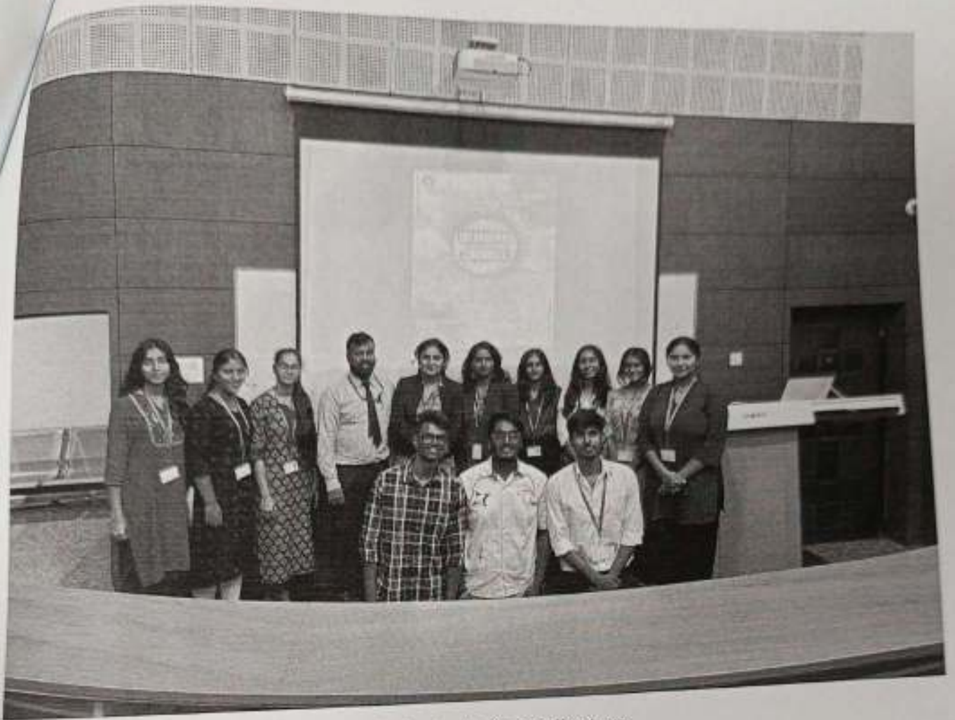
Image 5: Faculty coordinators along with the student coordinators.