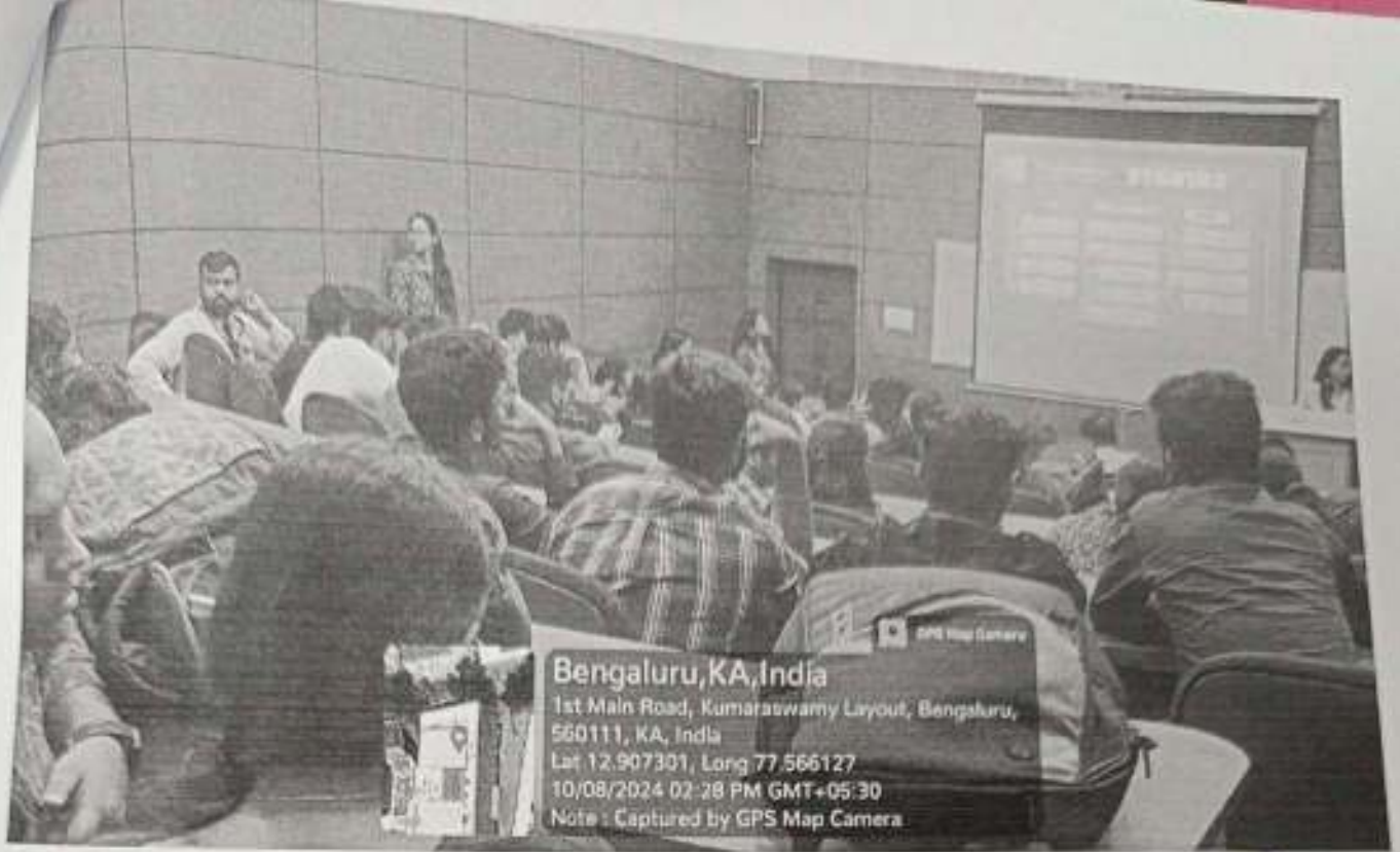
Image 3: Participants waiting for their score card and final result of the event