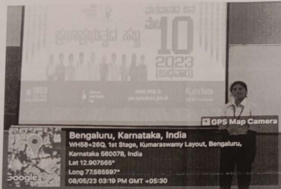
1. Lakshmi Speech about Vote Awareness