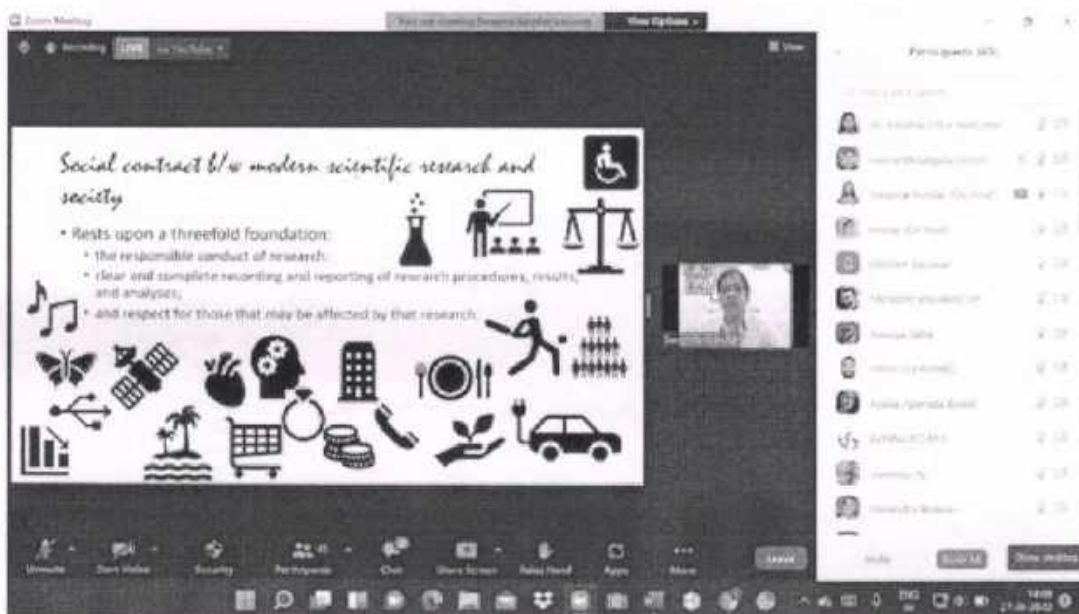
Photo2: FDP Session 2_Mrs.Sapna Sunder