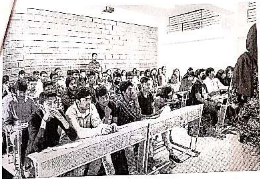
Photo -3 Participants