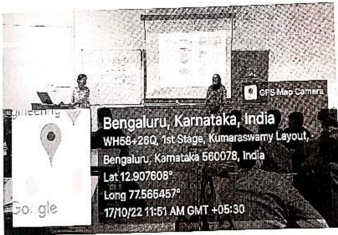
Photo -4 Q &A session of the workshop.