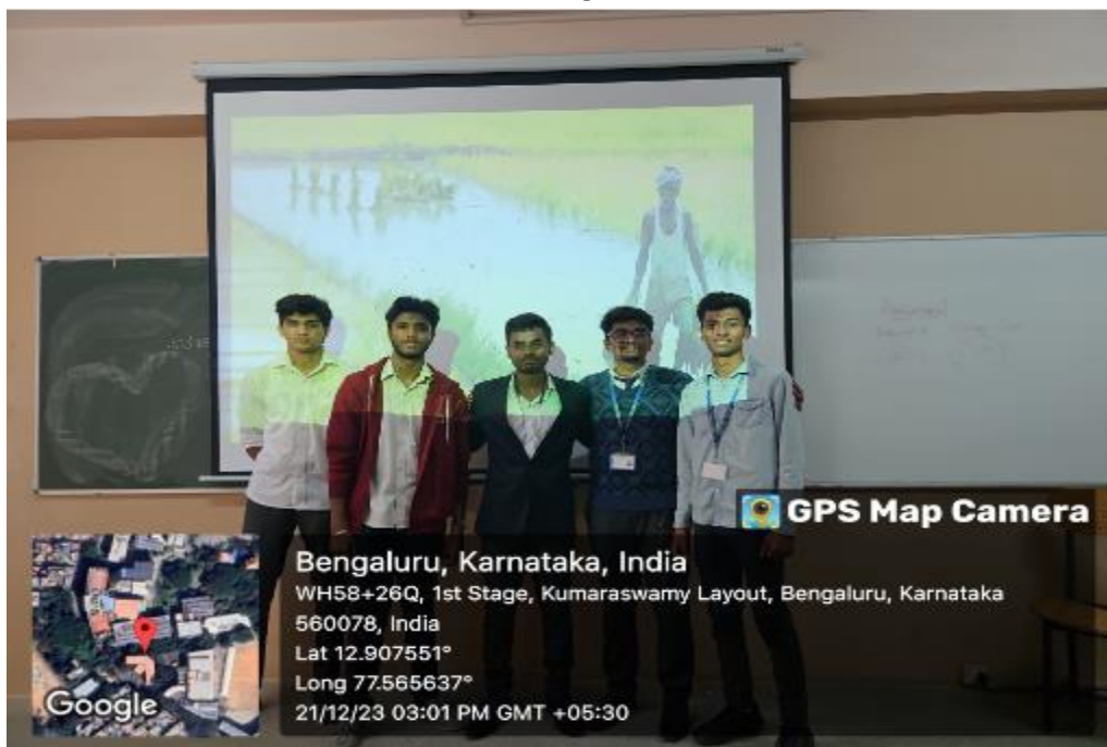
Photo 4. Group photo