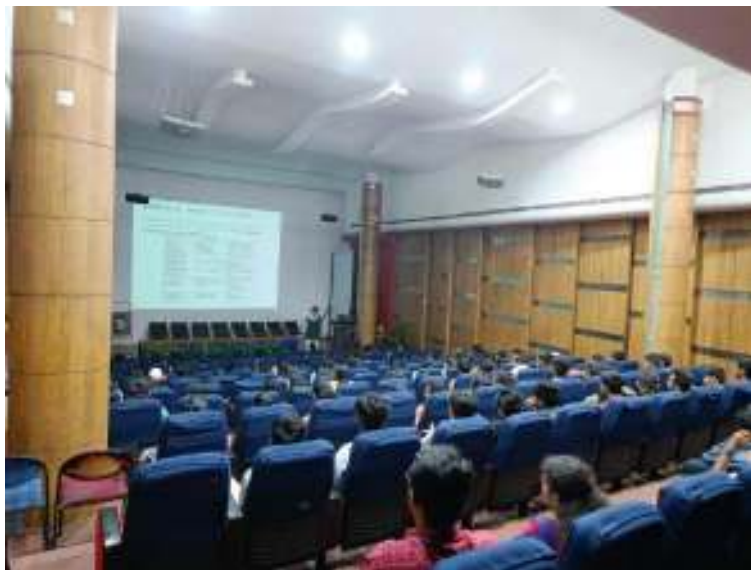
Photo 4 Students and staffs participating in a event