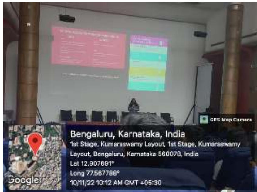
Photo 2 Speaker started the session