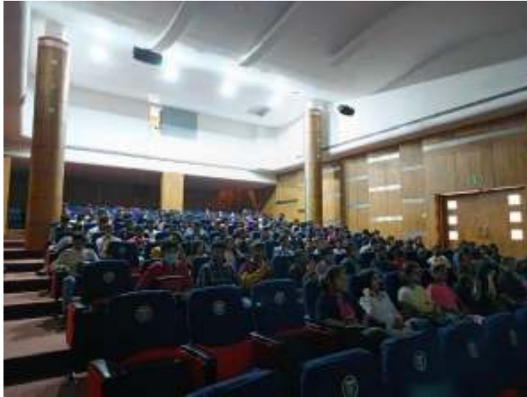
Photo 3 - Student Participation