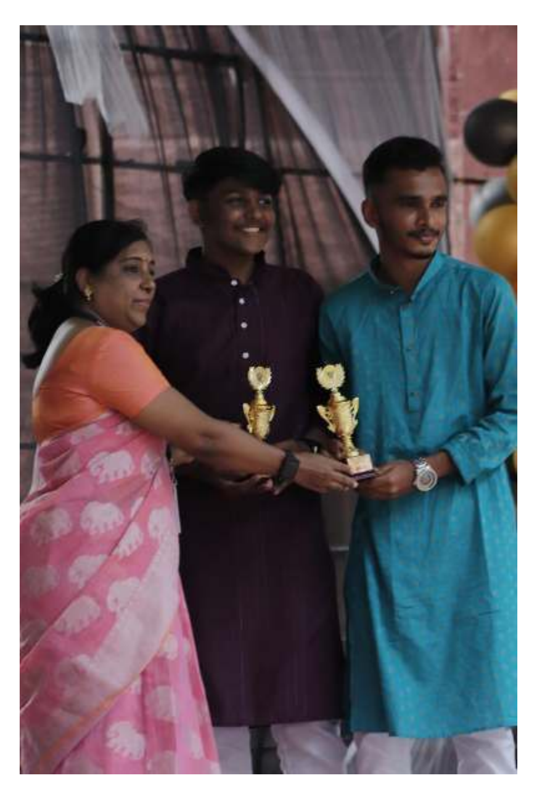
Prize Distribution for Pot painting.