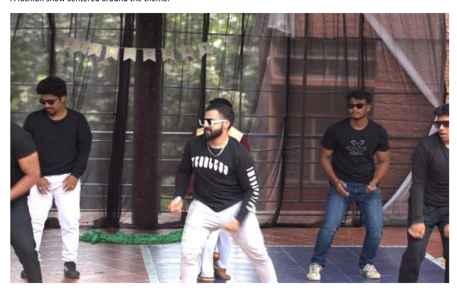
Students showcasing the talent with dance performance.