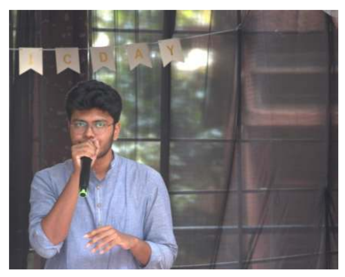
Student showcasing the talent with unique performance.