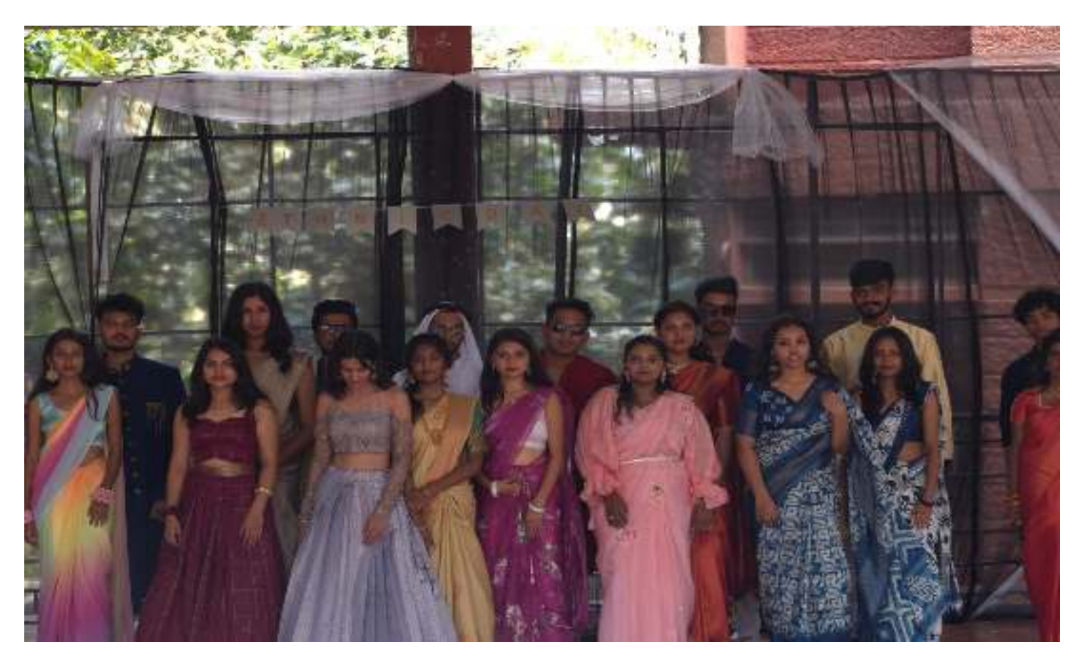
A fashion show centered around the theme.