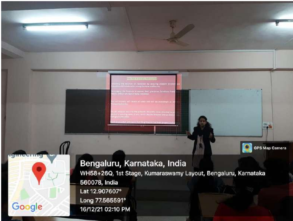
Photo 2- objective of grievance cell