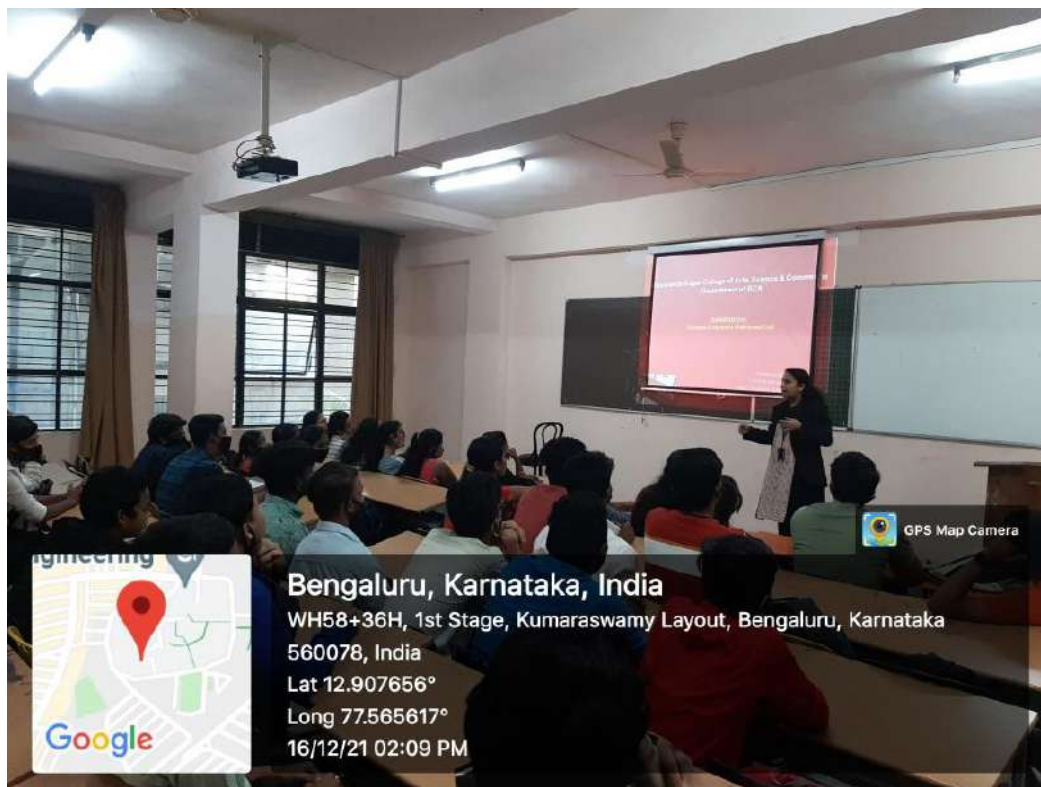
Photo 1 - Introduction of Student Grievance Redressal cell