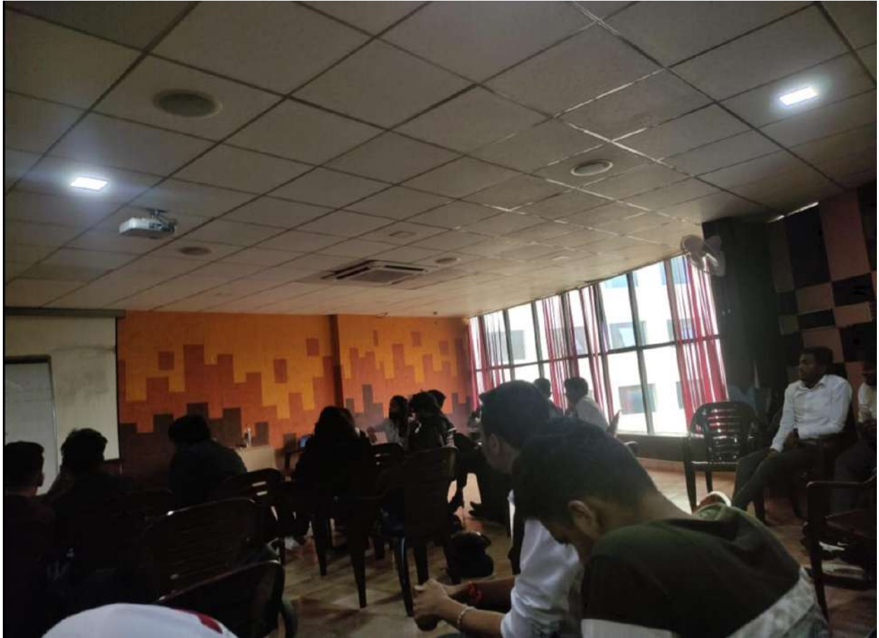
Pic 3 : Students in groups 4 BCA A