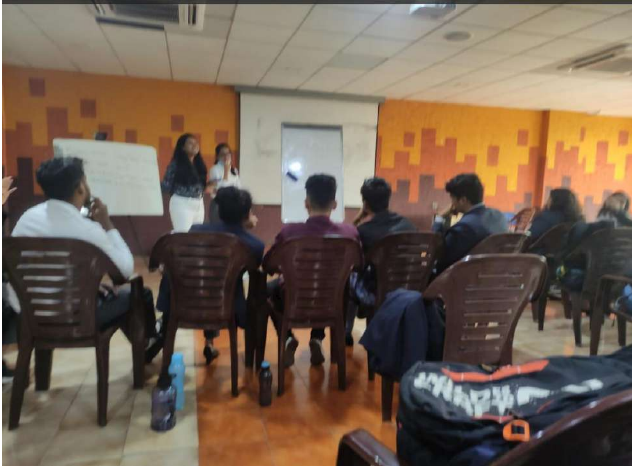
Pic 2 : Speaker explaining EQ to students