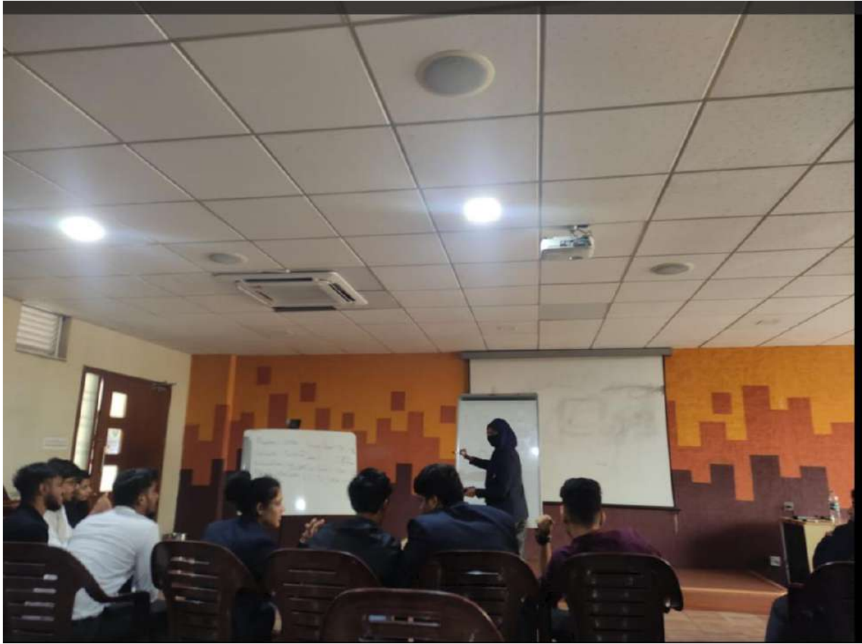
Pic 1 : Speaker explaining tasks 4 BCA A