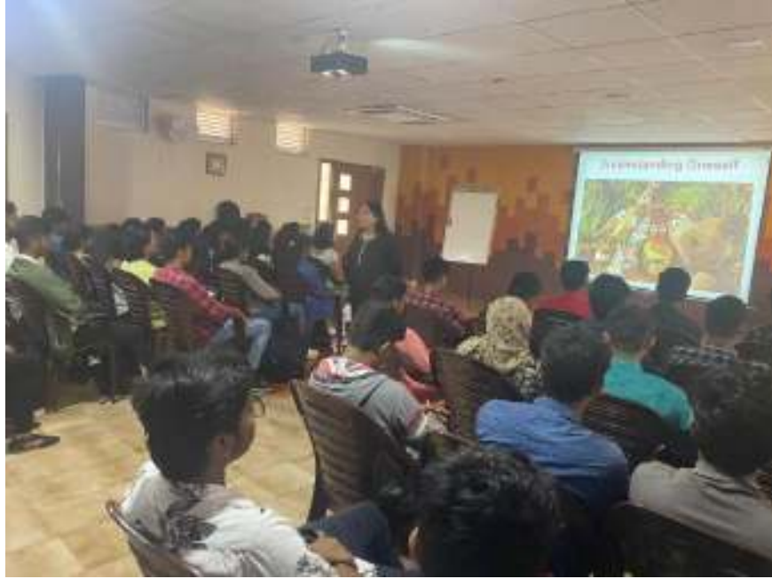
photo 3- Student Participation