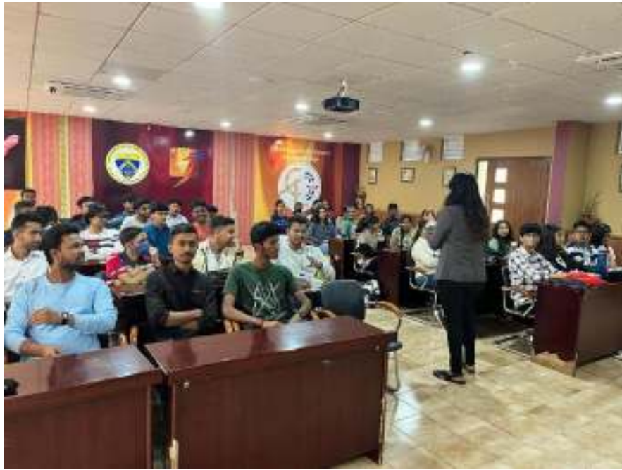
Photo 4- I BCA A section Students Participating in CIL