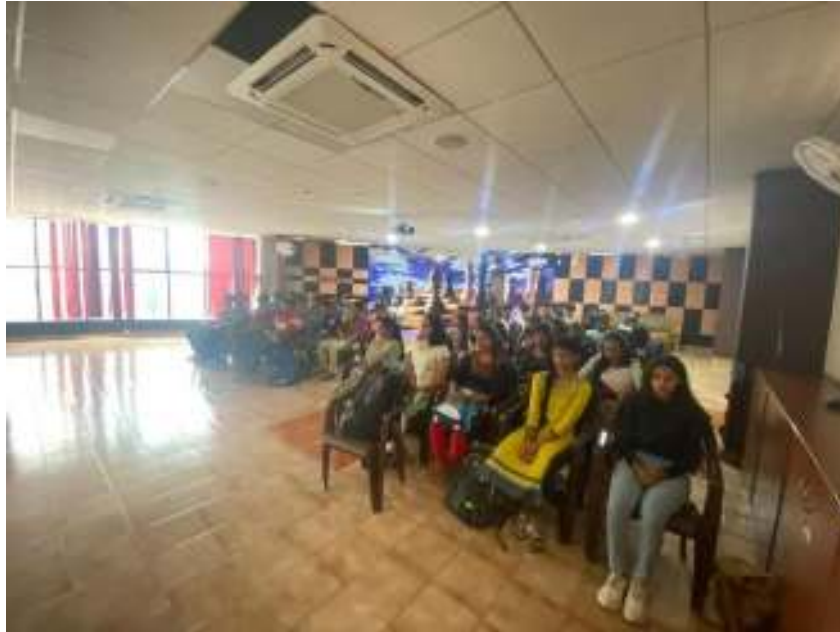
Photo 1 - I BCA B Section Student Participation