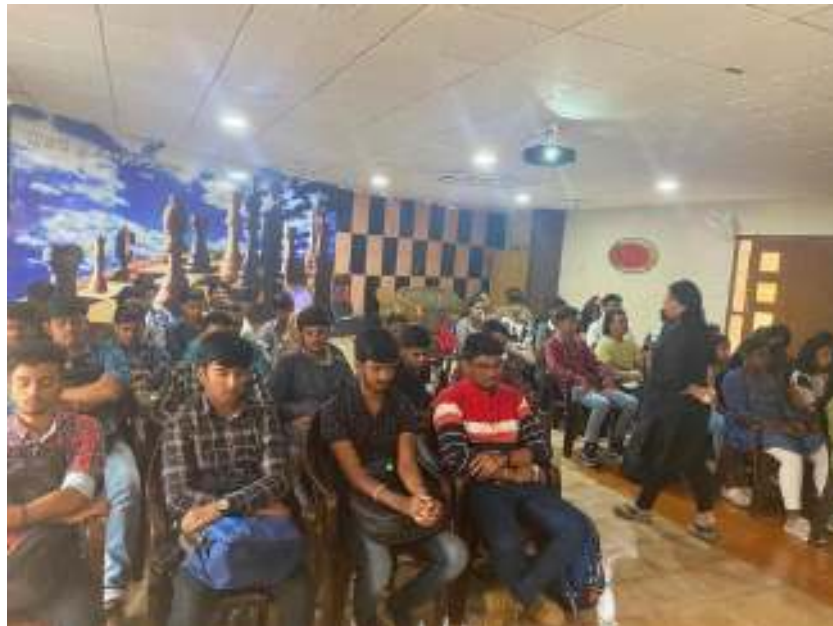
photo 2- trainer started the session with Activity