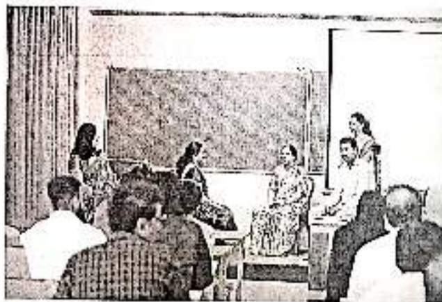
3 Activity done by the trainer