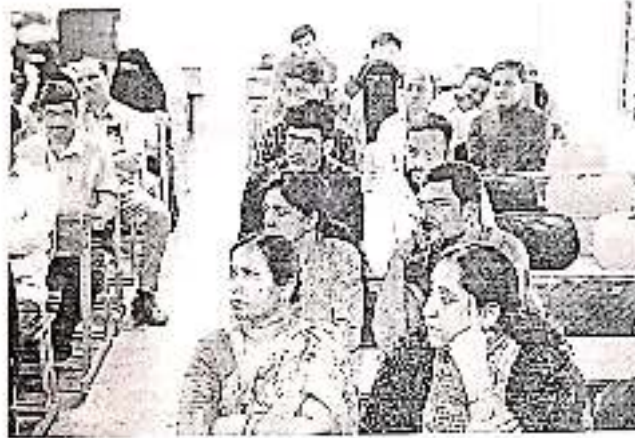
5 Parent's participation