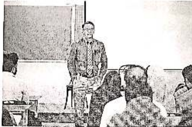
1 Address by the Vice Principal