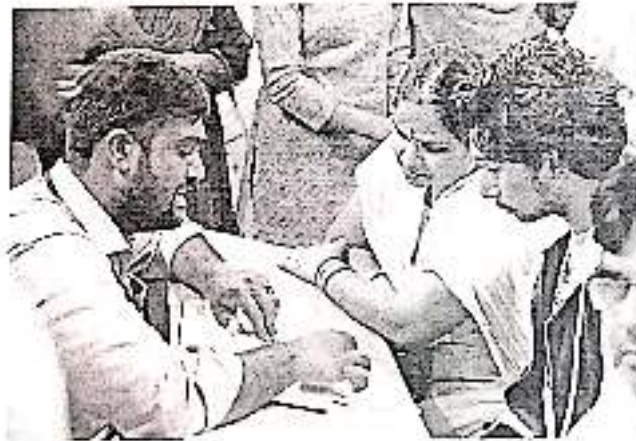
6. IA Marks and Attendance showing to Parents