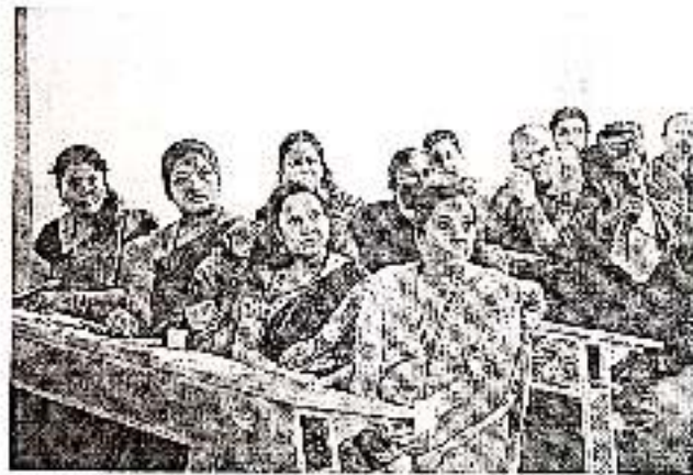
2 Faculty and Parents participated in Meeting