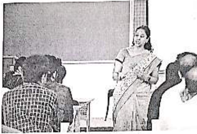
4 Parent Counseling session