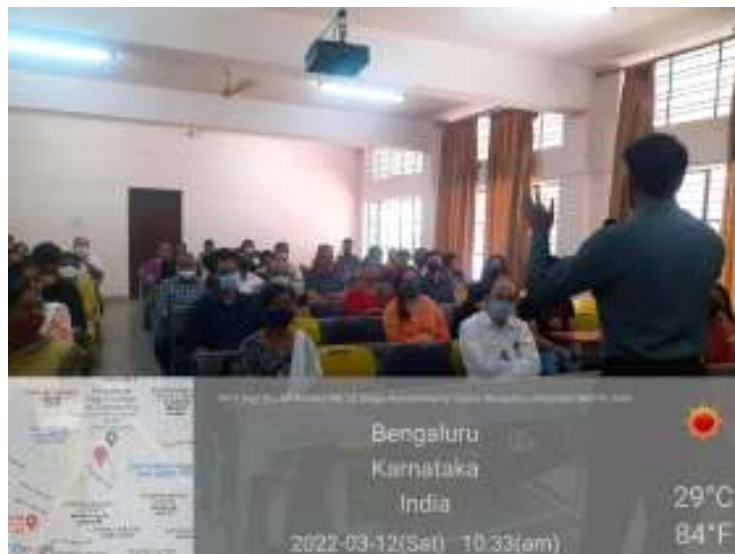
Photo 2 - Parents listening to Vice principal