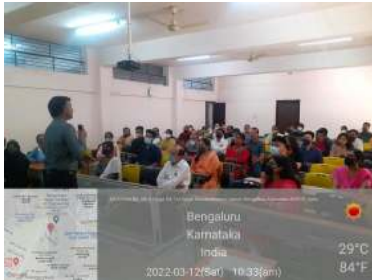
Photo 1- Vice principal addressing parents in PTM