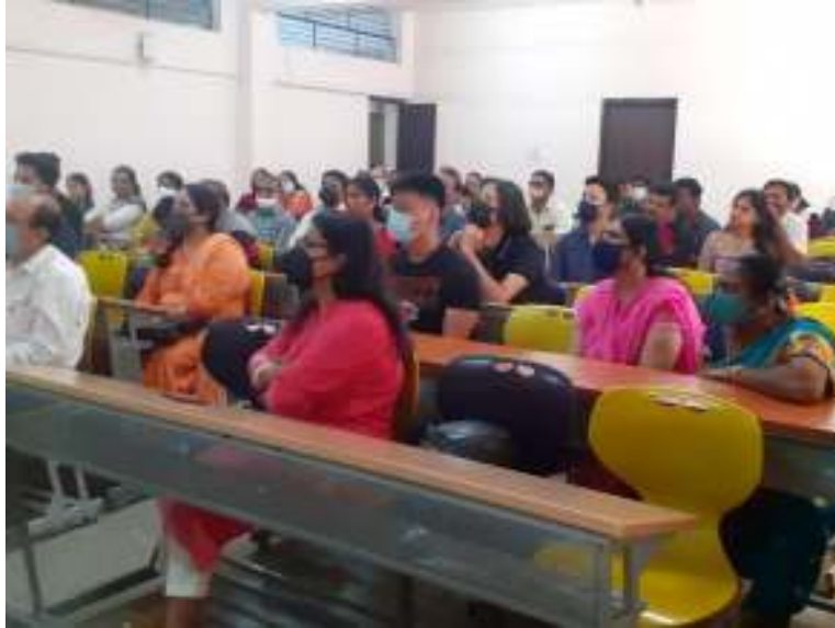
Photo 3 - Parents participation in PTM