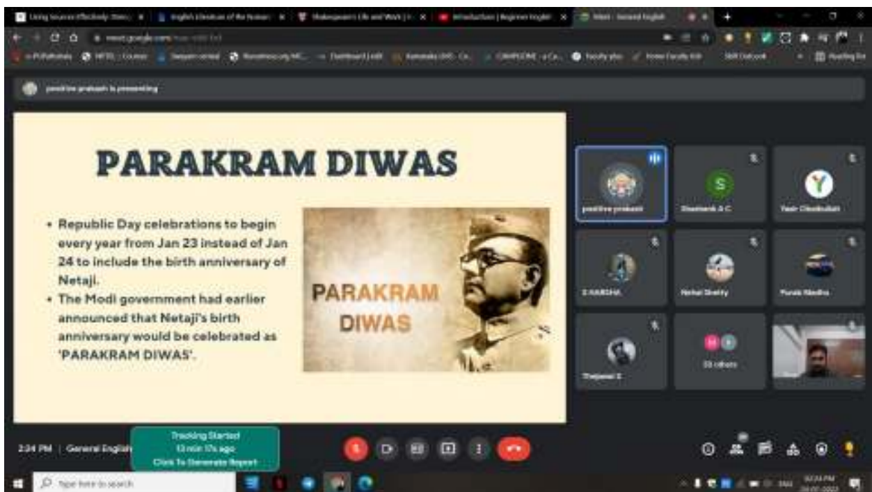
3. Importance of Parakram Divas.