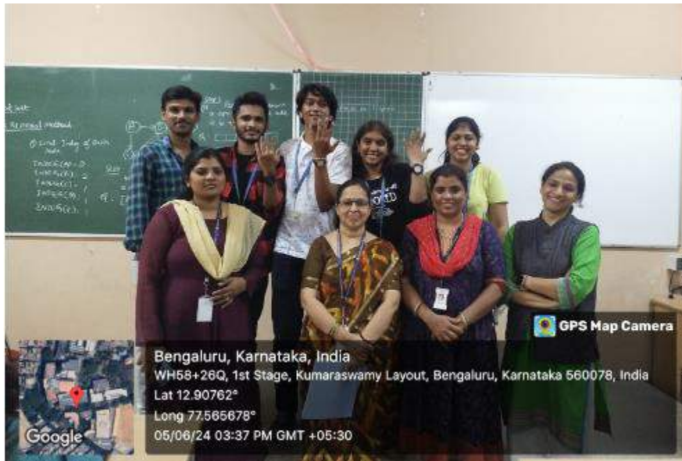
Photo -4 All participants with Judges