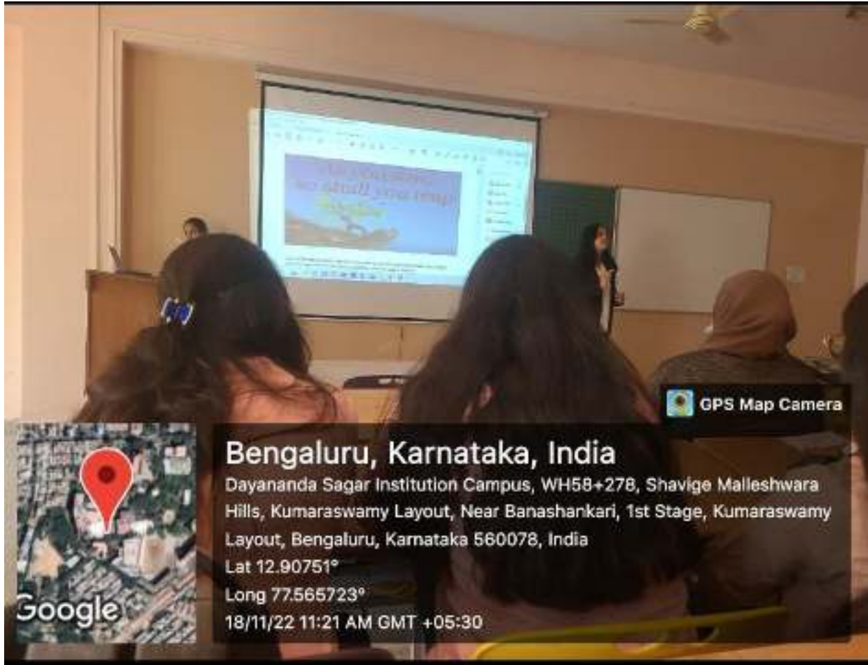
Pic 3 : Sow a character ,reap a destiny