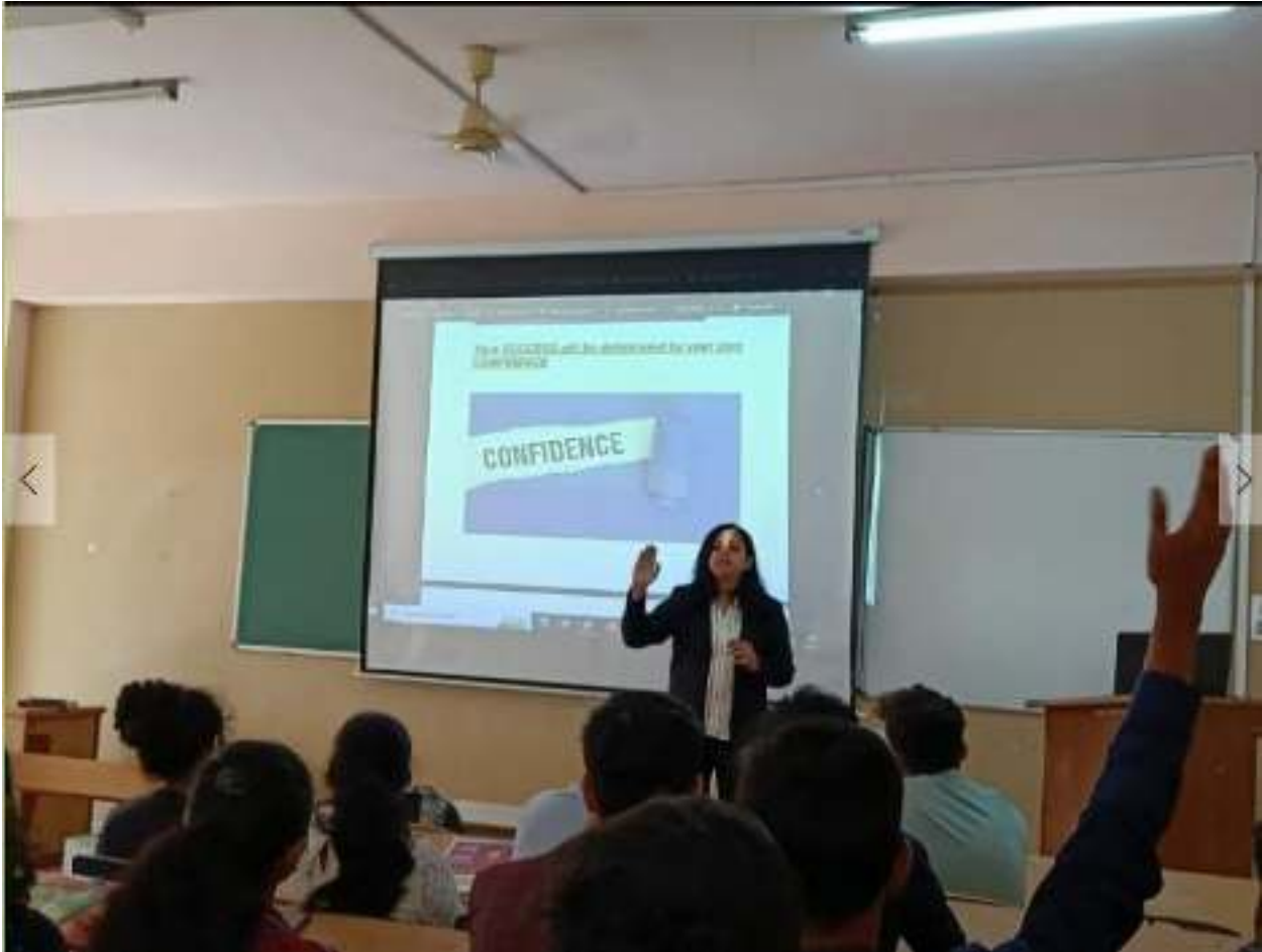
Pic 4: Confidence is important