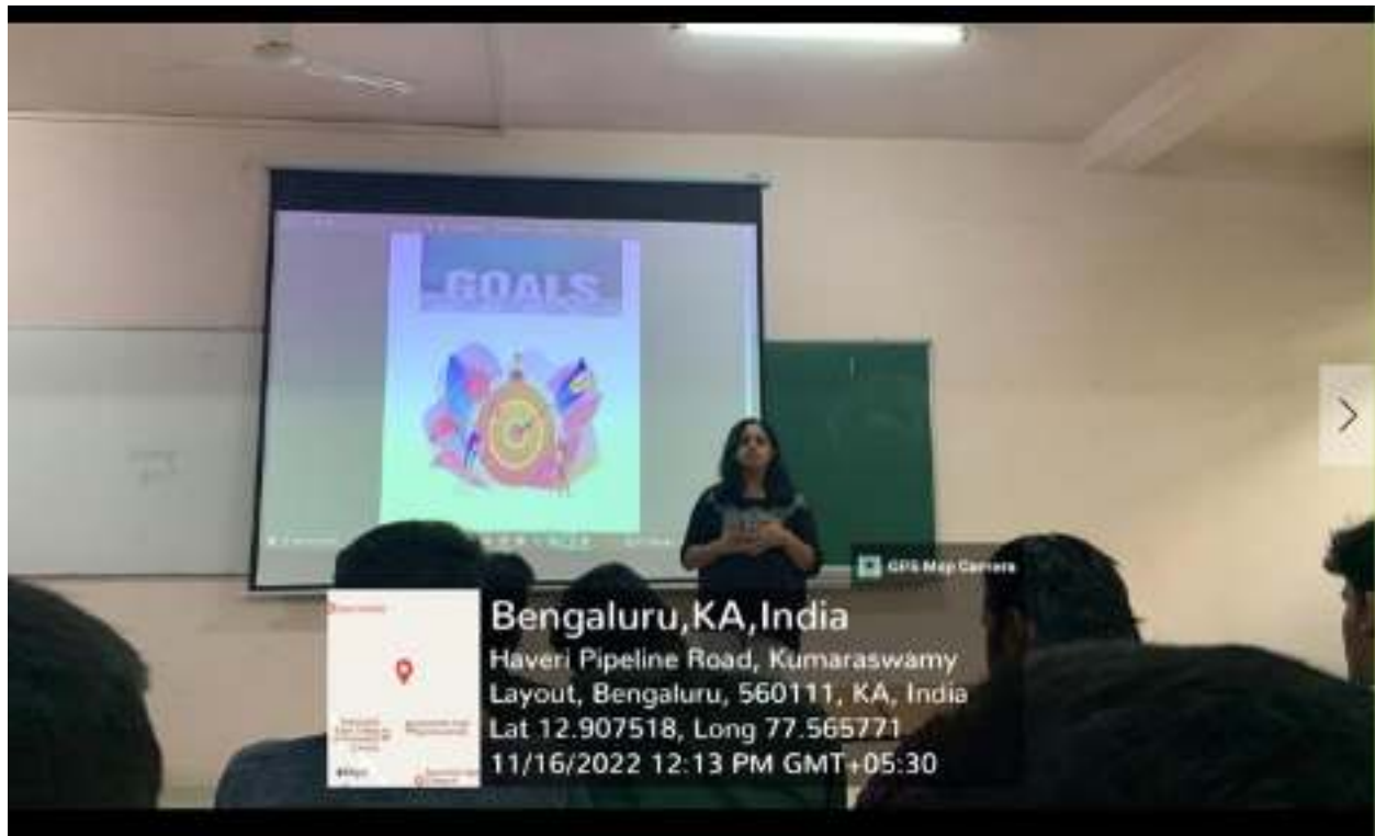
Pic 1 : Sushma explaining about goals