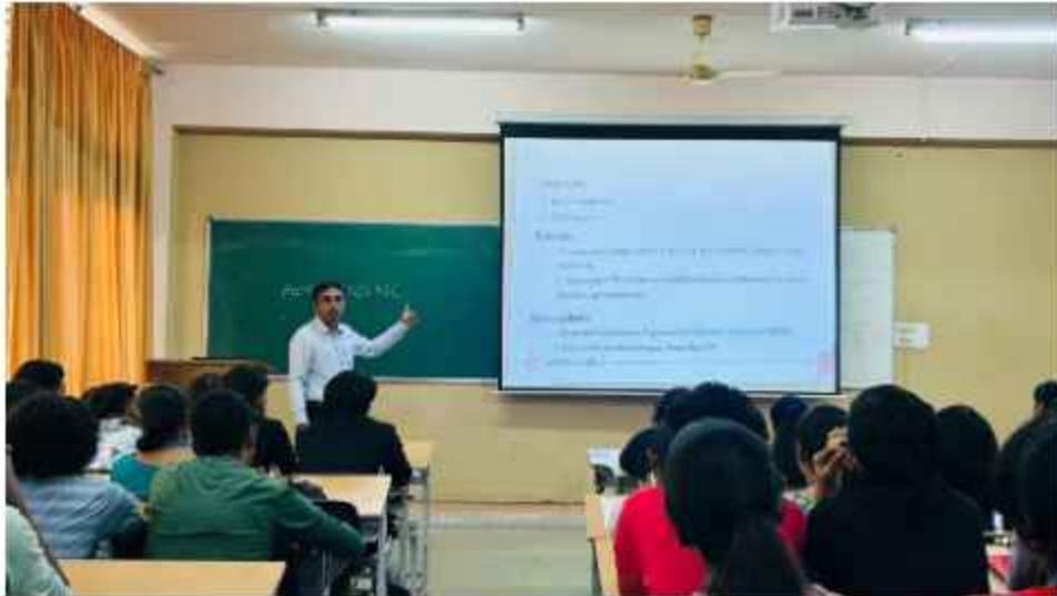
Photo1:The Speaker giving the agenda of Guest lecture