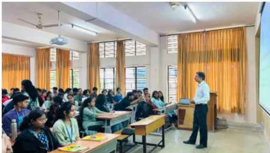
Photo2:The speaker is addressing the students