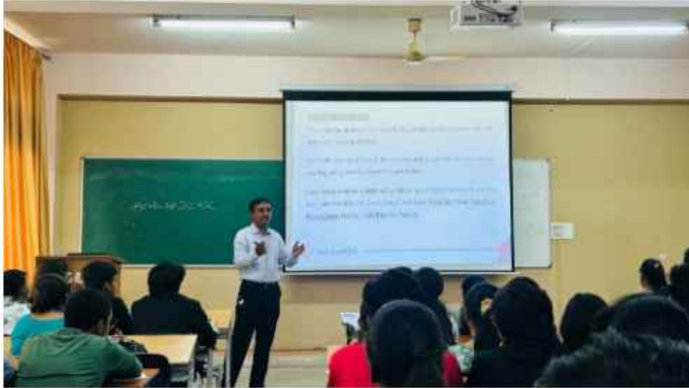
Photo3: The speaker is explaining the collection framework