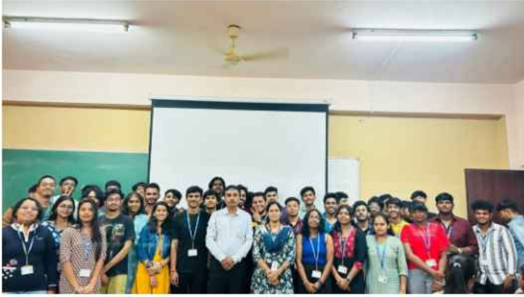
Photo5: Group Photo with the speaker