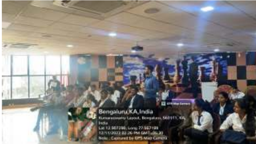
photo 3- Interactive with Students