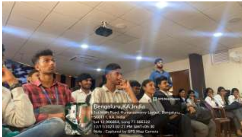
Photo 2- Speaker explanation