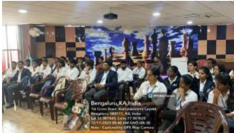
Photo 1 - Student Participation