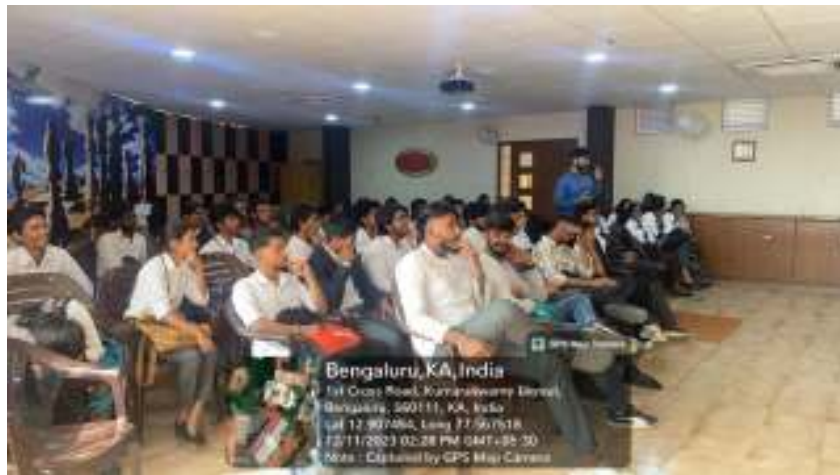
Photo 4- IIIrd Sem Student Participiation