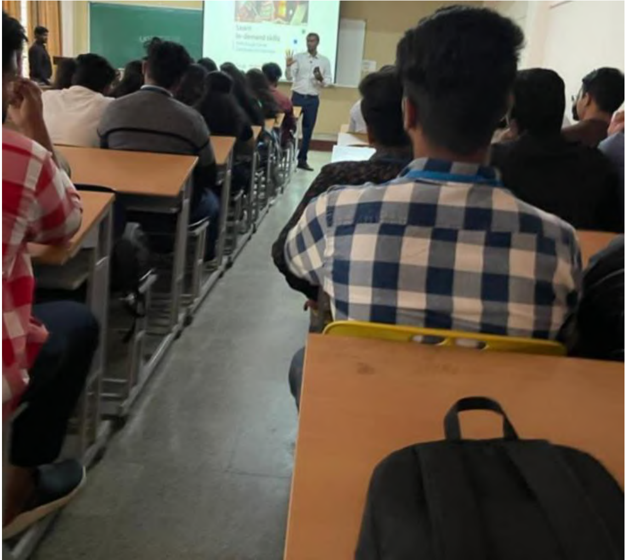
Pic 4: Skills required by the student for career development