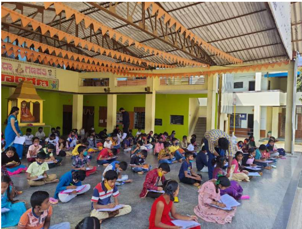
2. DSCASC students volunteering exam