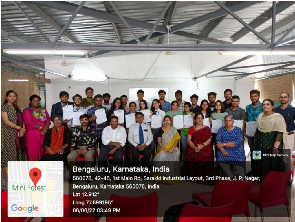
1. Group photo with Satya Educare Competency Trust