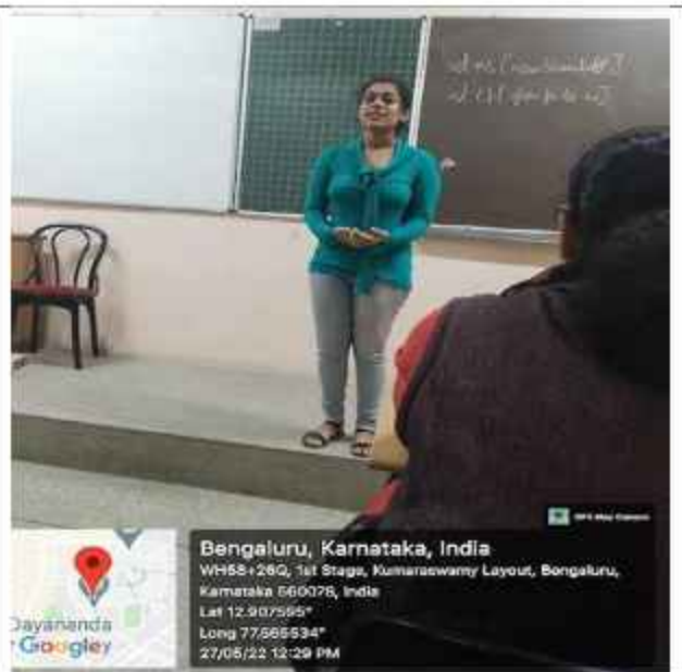
4.Abhigna IV A sem