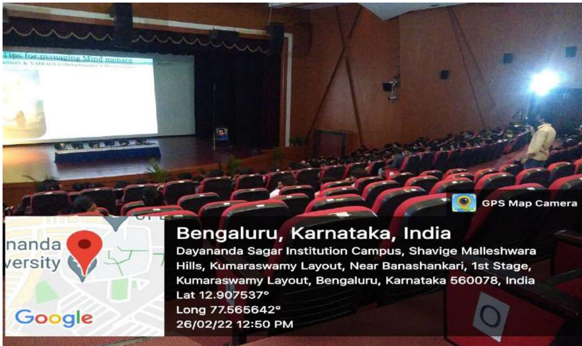
3. Photo of the Interactive session with participants