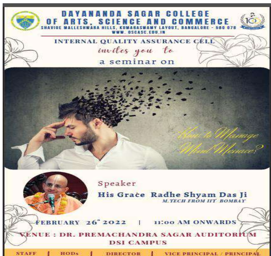
1. Poster of the seminar