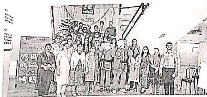
Photot 5: Faculty group photo