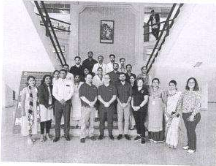
Photo1 : Representatives of various foreign universities with Vice Principal & HOD – BCA and faculty members.