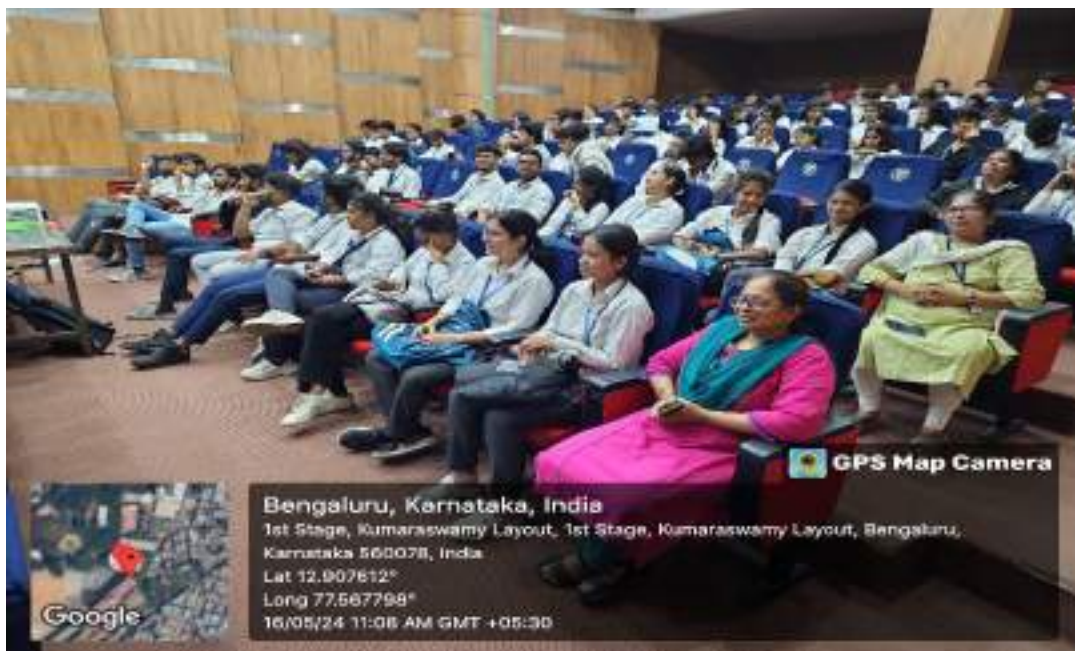
Photo 2: student participation in the guest lecture.