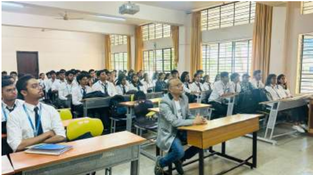
Photo 4: student participation