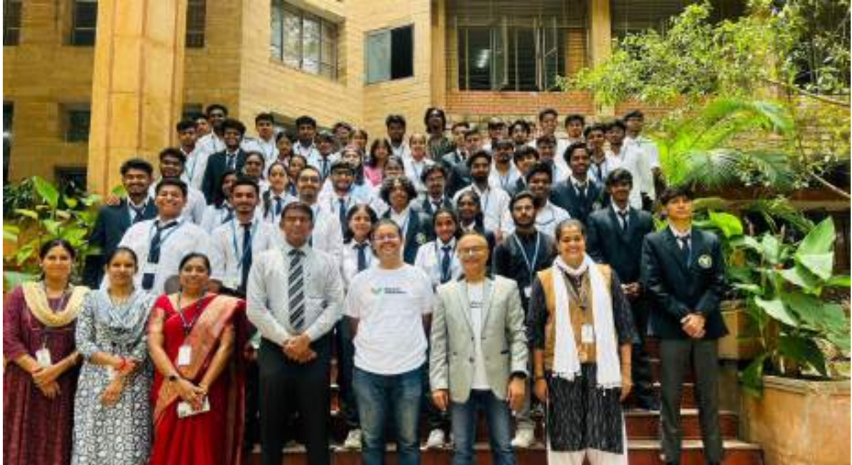
Photo 1: Group photo of BCA 2 nd sem with Vice- Principal, HODs and BCA faculties.