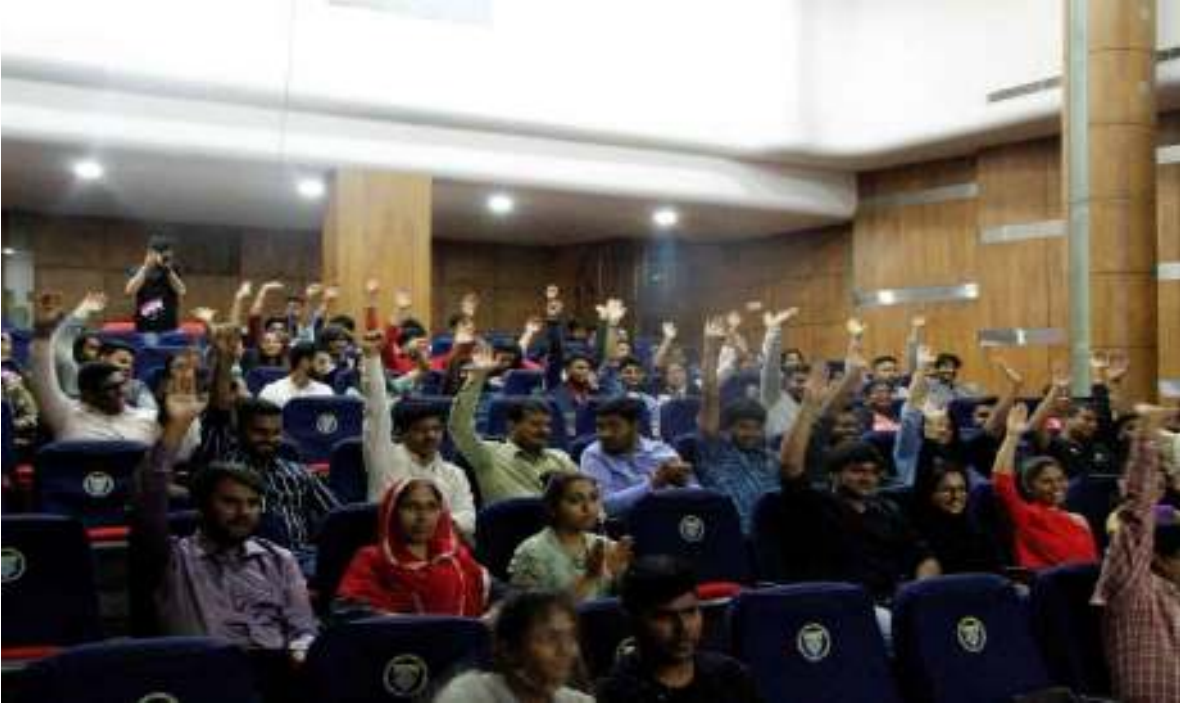
4. Voting for Office Bearers