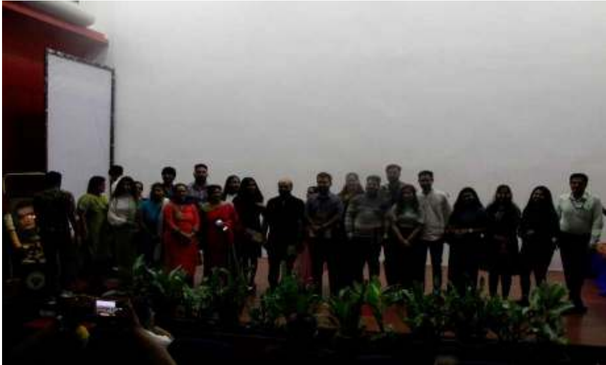
5. Group photo