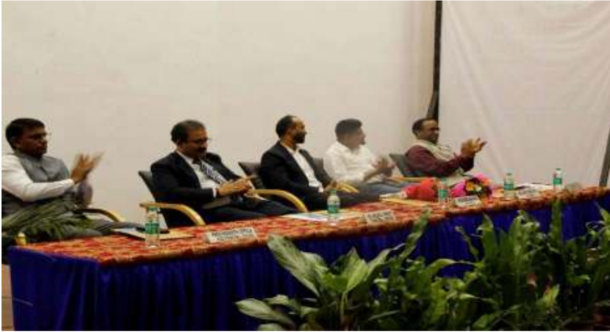
2. Dignitaries on the dais