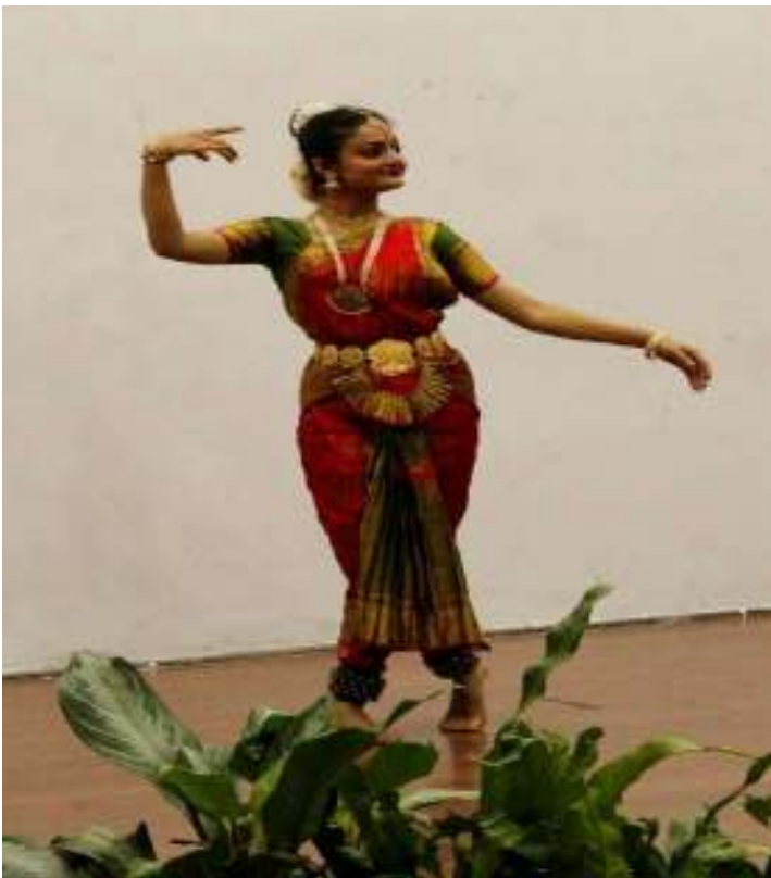
3. Cultural Program