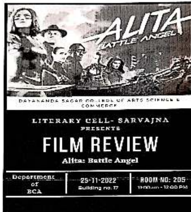
Photo-1 Poster of the event.