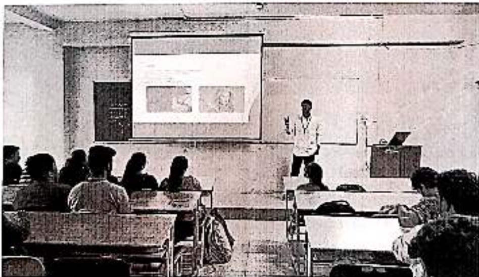
Photo 2- Overview and Plot of the film