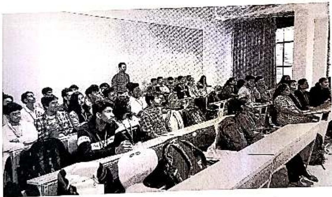
Photo 4- Student Participants