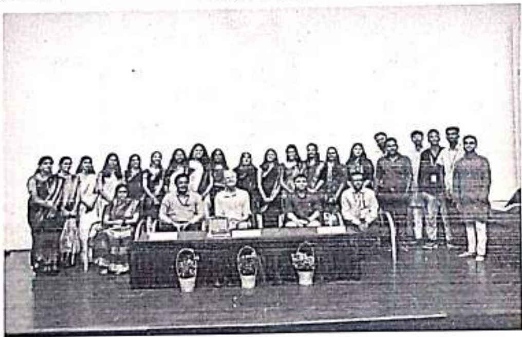
Volunteers with Chief Guests and faculties