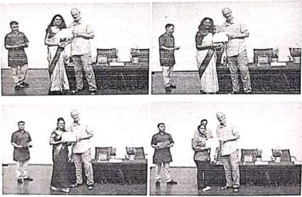
Certificate distribution to the winners