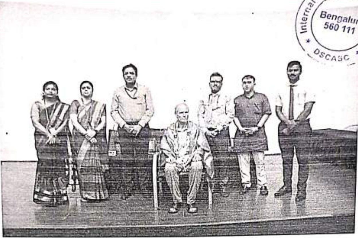
Felicitation to the Chief Guest