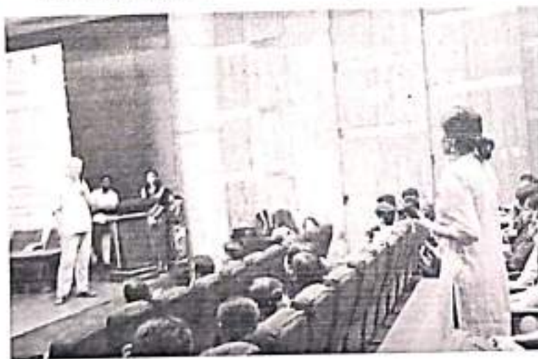
Question & Answer session