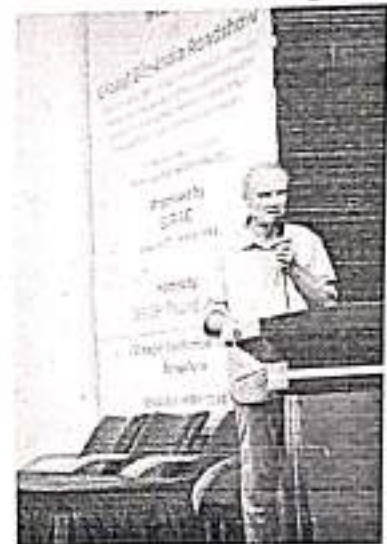
Speech by Chief Guest