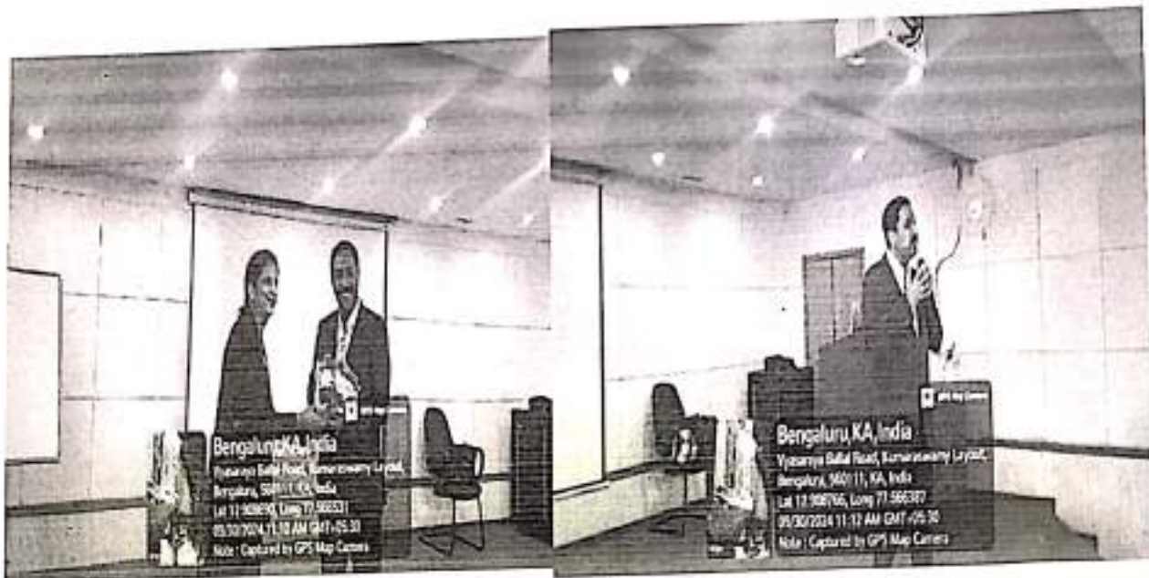
Photo#1: Welcoming to the Resource person Photo#2: The Resource person with students