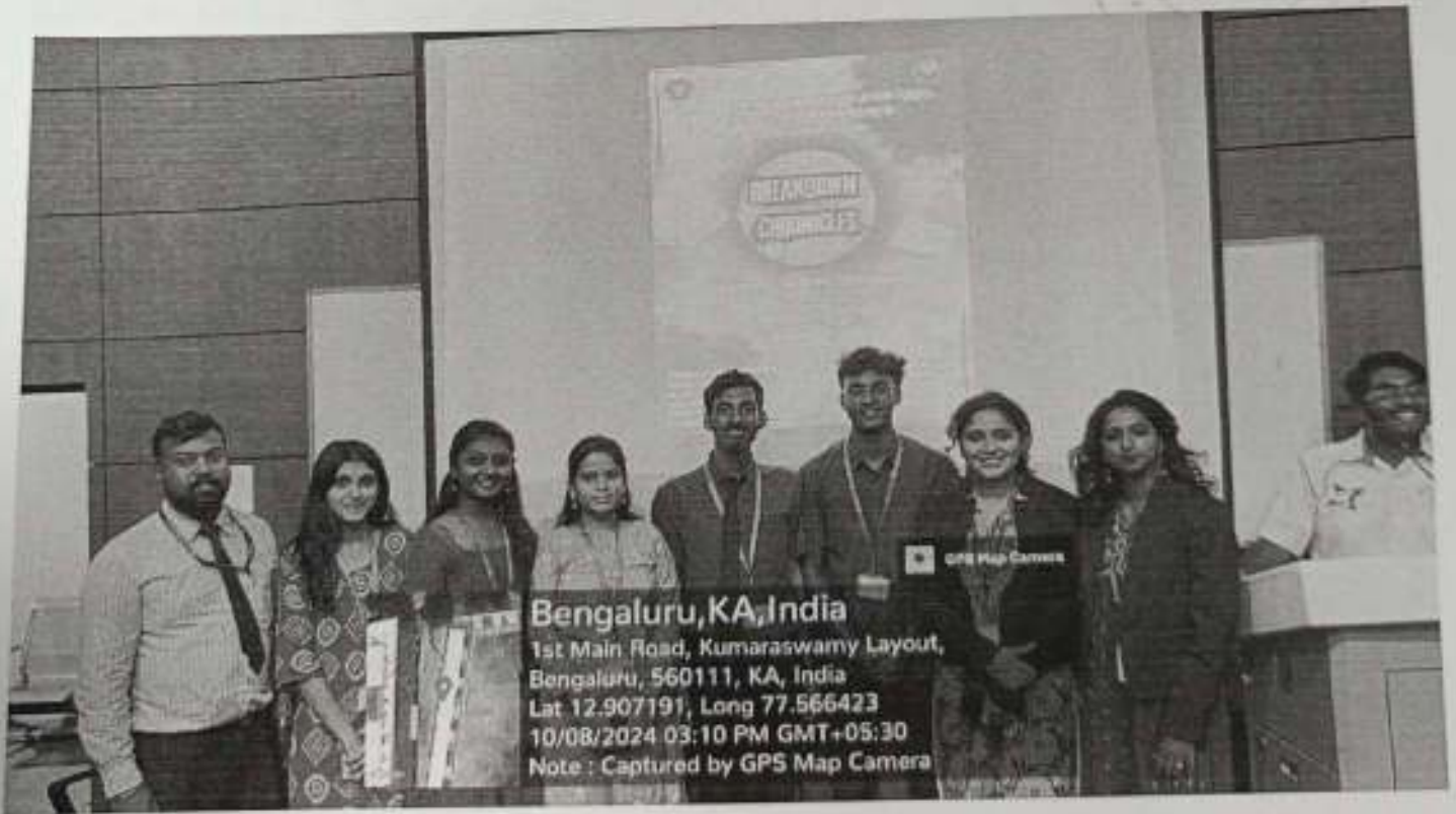
Image 3: Participants waiting for their score card and final result of the event

Bengaluru,KA,India 1st Main Road, Kumaraswamy Layout, Bengaluru, 560111, KA, India Lat 12.907191, Long 77.566423 10/08/2024 03:10 PM GMT+05:30 Note : Captured by GPS Map Camera