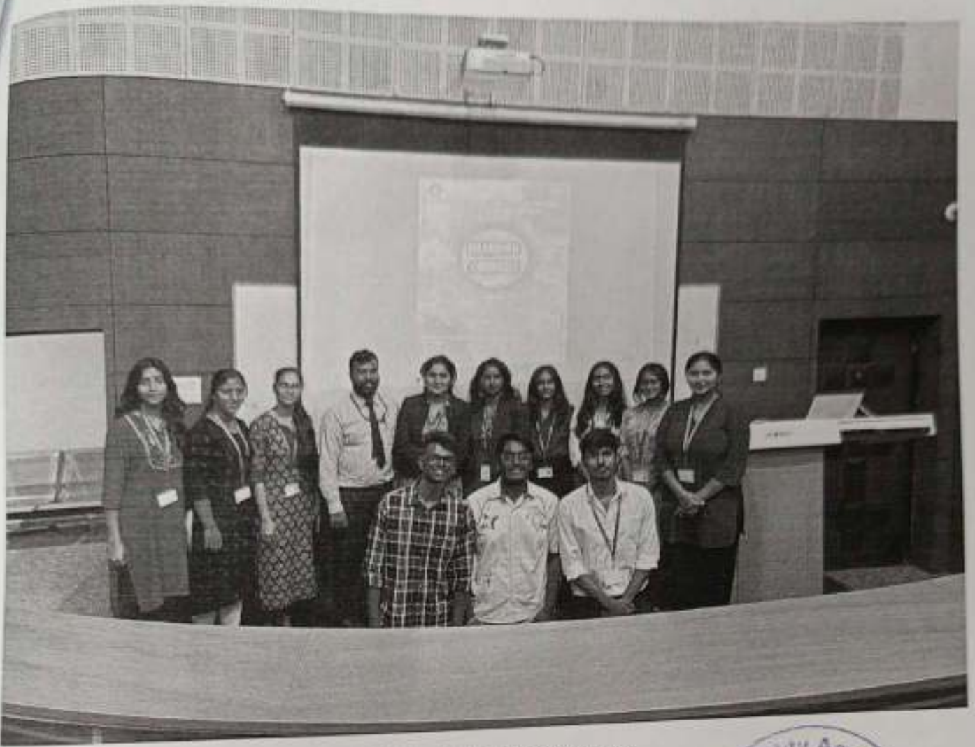
Image 5: Faculty coordinators along with the student coordinators.